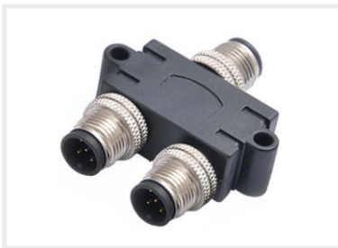
Y-type M12 connector for connecting multiple sensors simultaneously via RS485